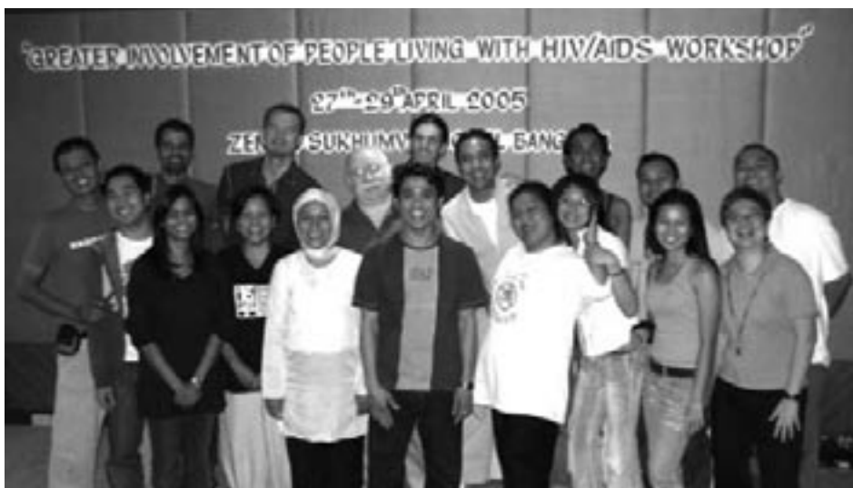
Seven Sisters Pilot GIPA workshop April 2005

In 2004 at the close of the XV International AIDS Conference, people living with HIV and AIDS in Asia-Pacific issued the following declaration: you can be a part of making it happen!