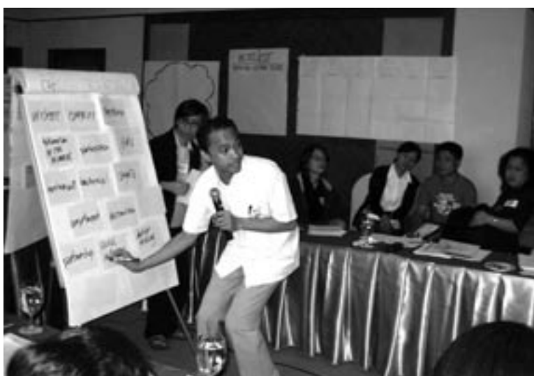
Seven Sisters Pilot GIPA workshop April 2005