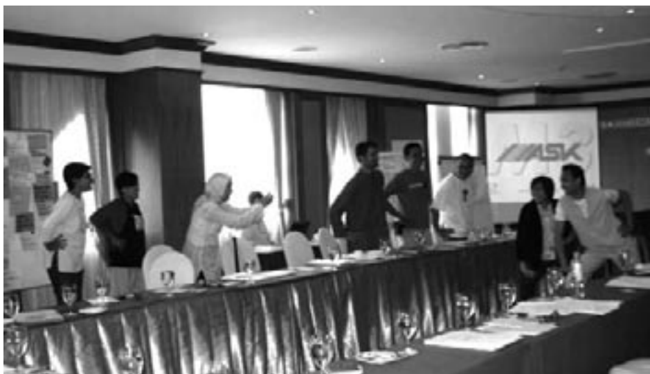
Seven Sisters Pilot GIPA workshop April 2005

From UNDP: From involvement to empowerment, p36