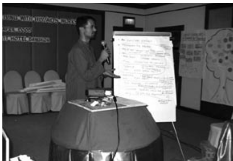
Seven Sisters Pilot GIPA workshop April 2005