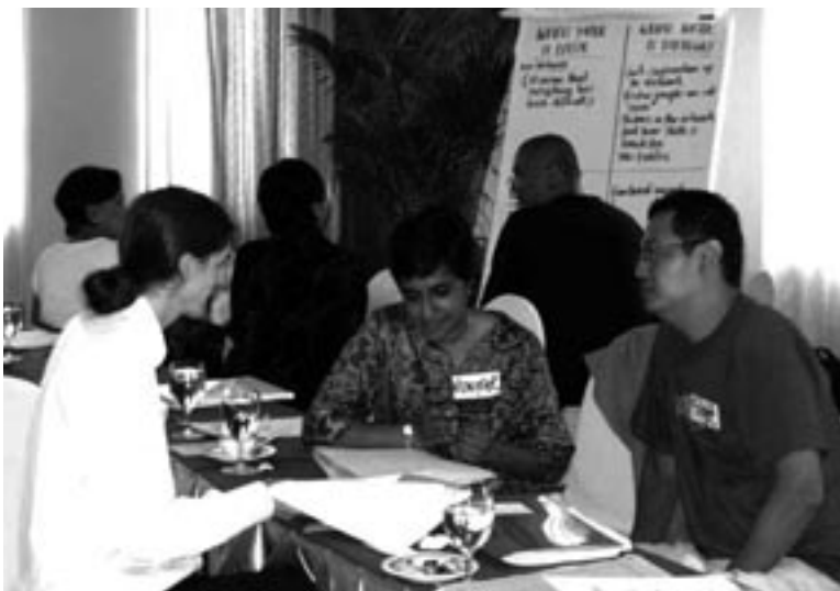
Seven Sisters Pilot GIPA workshop April 2005

Each response is usually multi-sectoral; that is, it happens at different levels of society, from the local (such as patient groups and affected networks, community-based organizations, hospitals and clinics, schools and businesses) to the national (such as human rights commissions, national ministries and national AIDS coordinating councils), regional (such as APN+, 7 Sisters, and APCASO) and international (such as the UN, International Federation the Red Cross/Red Crescent Societies (IFRC), international NGOs (INGO) and universities, which often work on the local, national and regional levels, too).