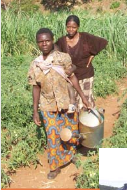
Anthu a m'midzi