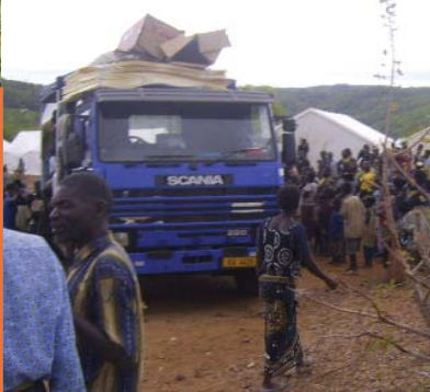
Mabungwe omwe siaboma