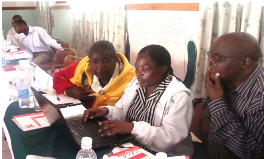
Participants formulating an initial organisational draft HIV and AIDS workplace plan at a SAfAIDS Accelerated Workplace Programme Planning Workshop.