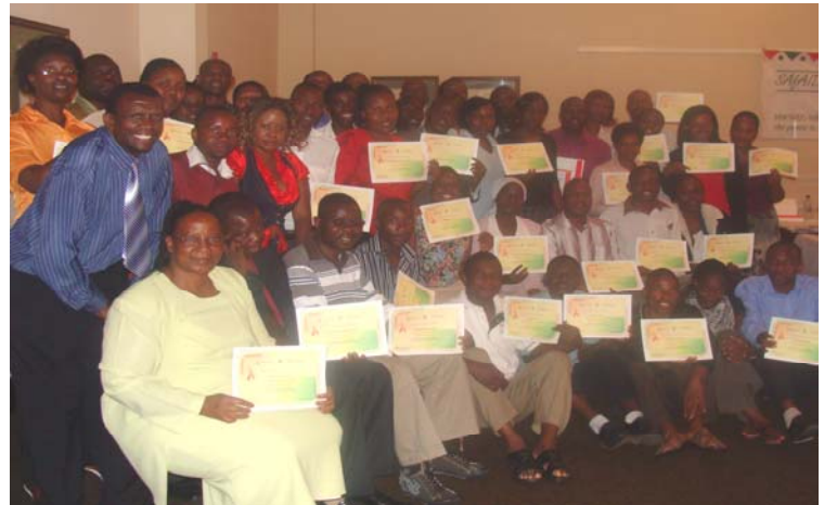
Participants with their certificates of participation at the end of a SAfAIDS Accelerated Policy Formulation Workshop